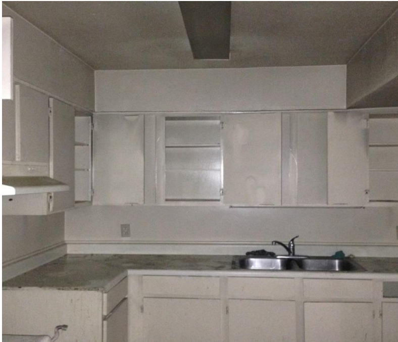
Kitchen: Current condition of cabinets.