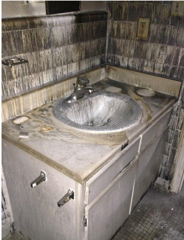
Bathroom: Smoke damage throughout entire room.