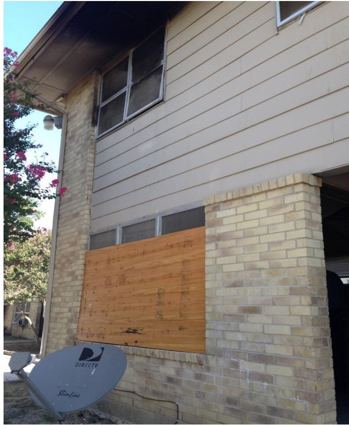
Front view unit #1503: Partial smoke damage around second floor southwest corner