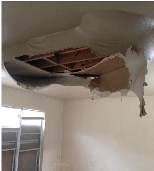
Living Room: View towards southwest corner. Ceiling GWB damaged during SAFD operations.