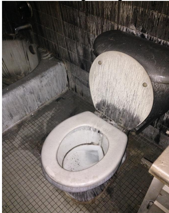
Bathroom: Smoke damage throughout entire room.