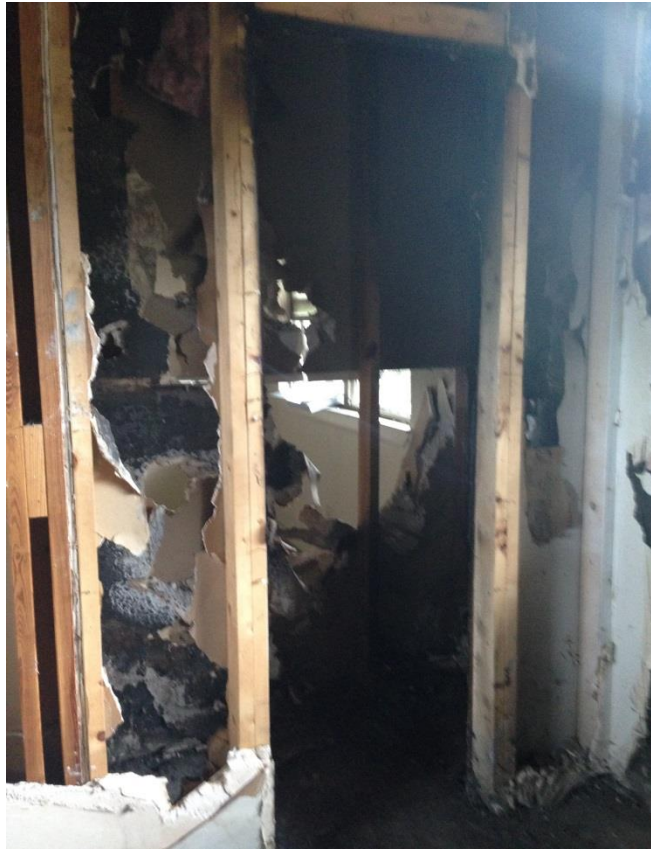
Bedroom #1: view of entry to closet.