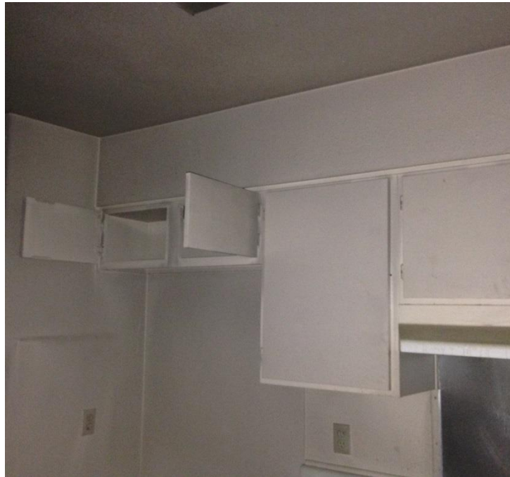
Kitchen: Current condition of cabinets.