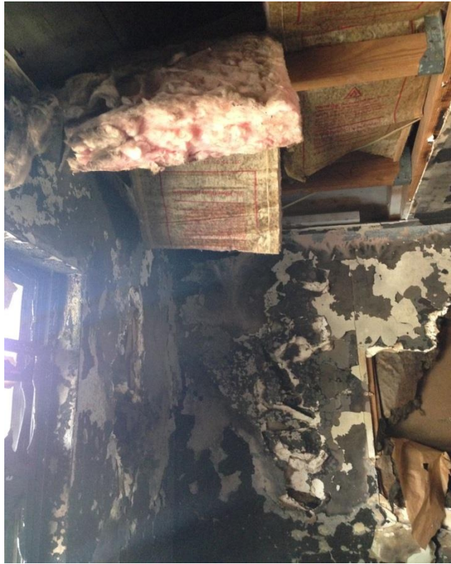
Bedroom #1: View towards southwest corner. Deep char in drywall.