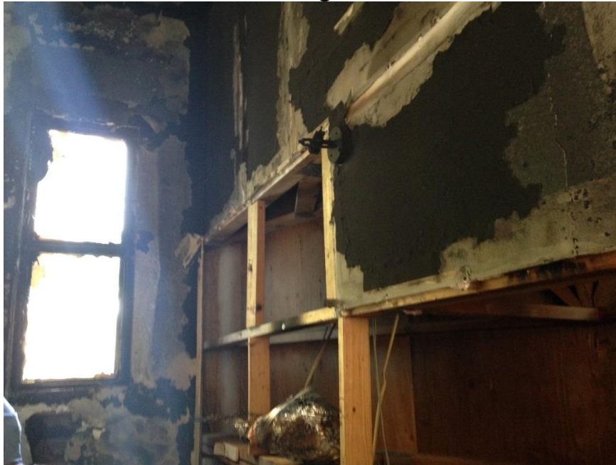
Bedroom #1: Interior view of closet. View towards southeast corner. Deep char in drywall.