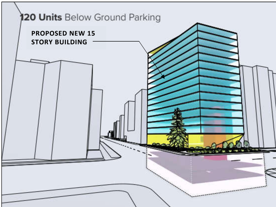
VIEW OF BUILDING SHOWING UNDERGROUND PARKING