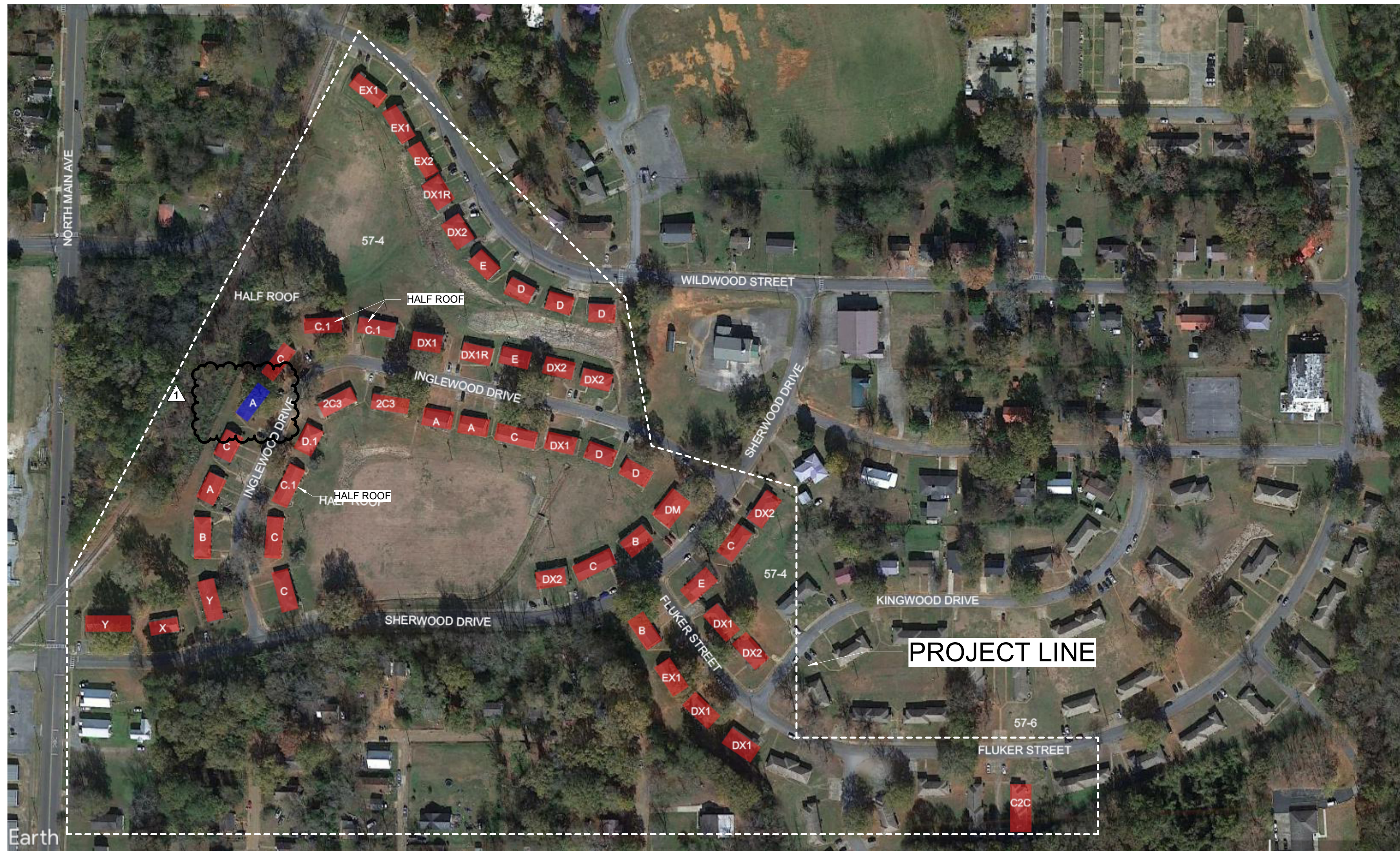
DREW COURT (57-4,57-6) - SITE/VICINITY PLAN

DREW COURT: 900 CRESTLINE AVENUE, SYLACAUGA, AL 35150 SYLAVON COURT: 415 WEST 8TH STREET, SYLACAUGA, AL 35150