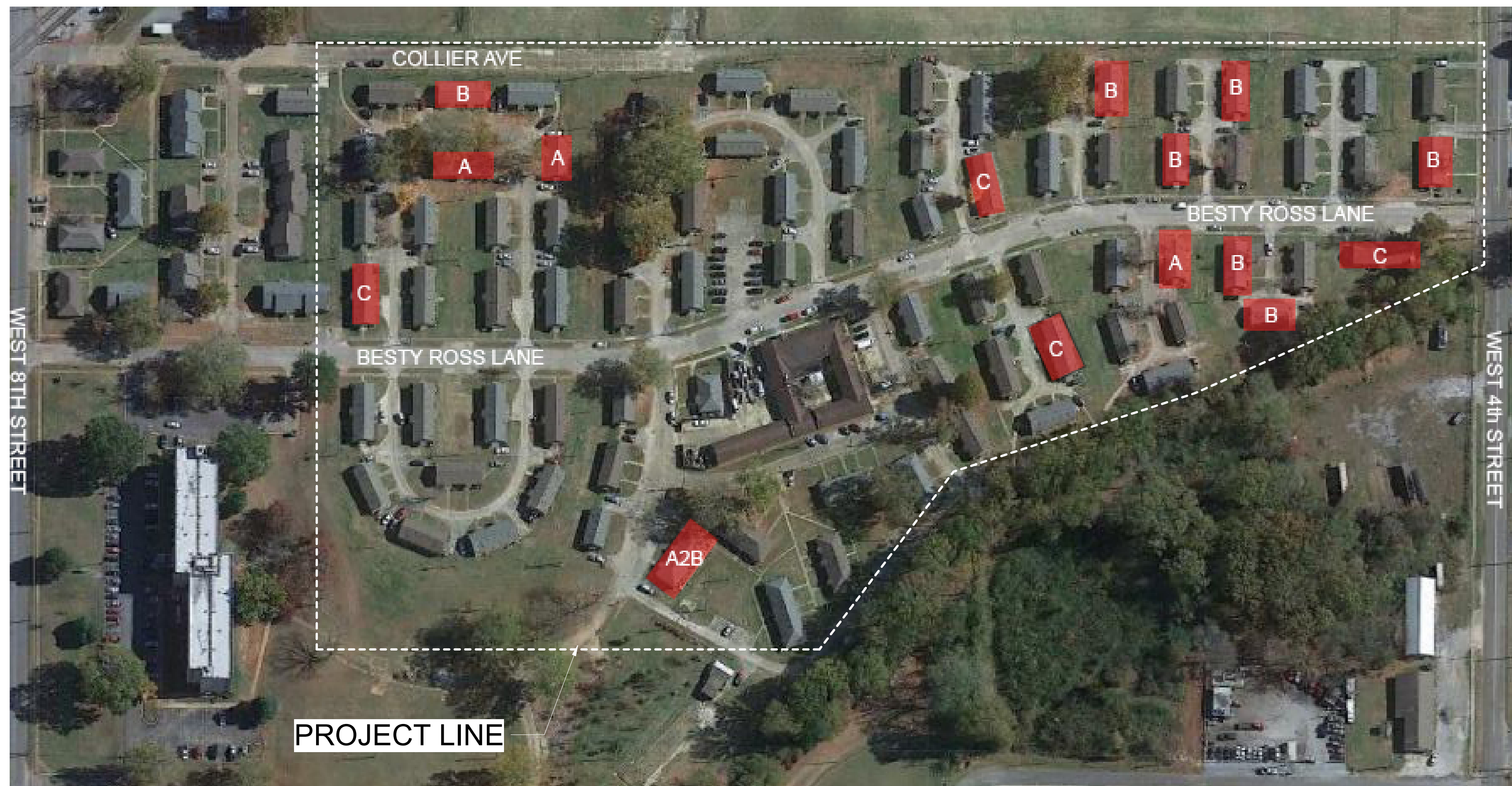
SYLAVON COURT (57-3) - SITE/VICINITY PLAN