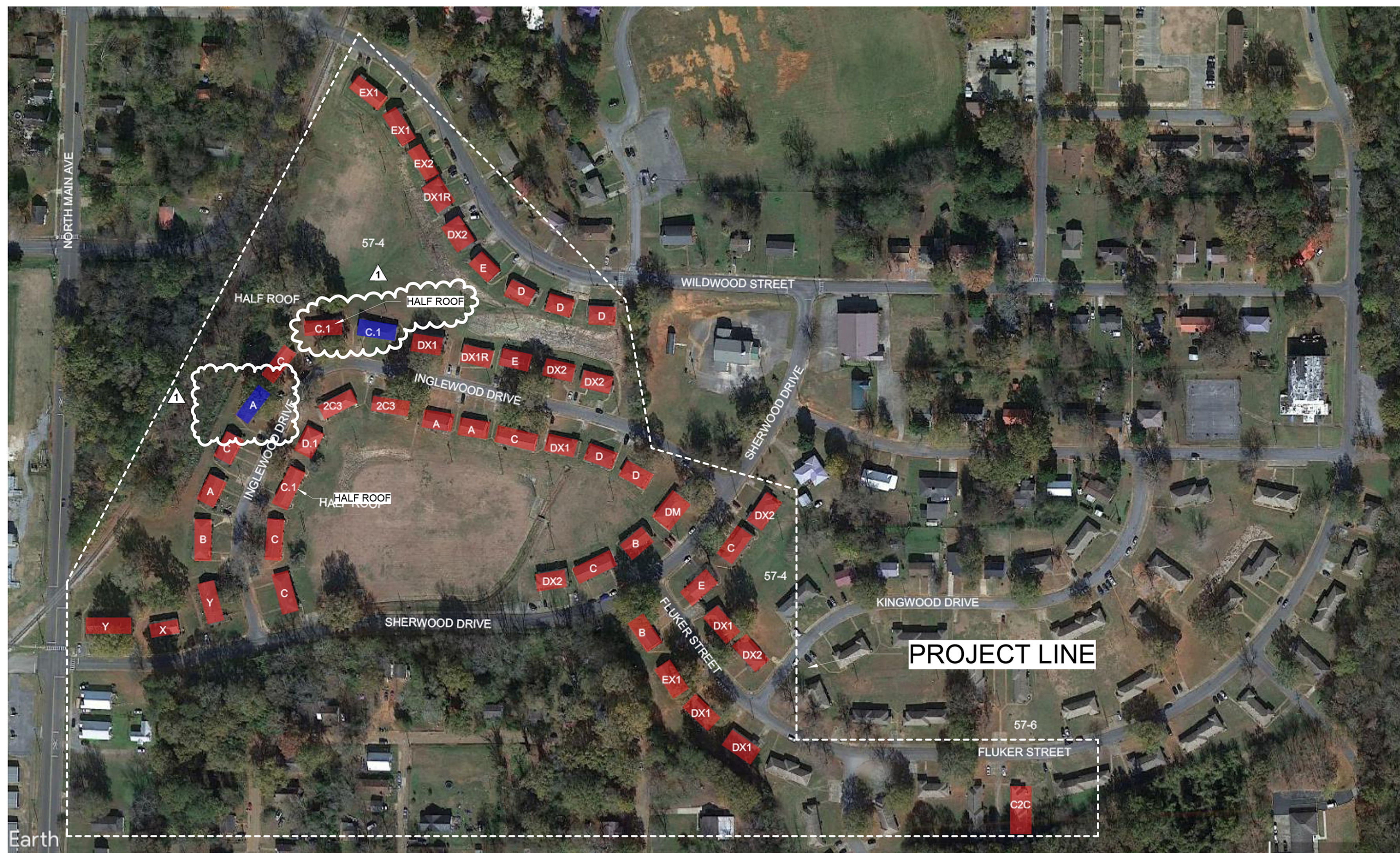
DREW COURT (57-4,57-6) - SITE/VICINITY PLAN

DREW COURT: 900 CRESTLINE AVENUE, SYLACAUGA, AL 35150 SYLAVON COURT: 415 WEST 8TH STREET, SYLACAUGA, AL 35150