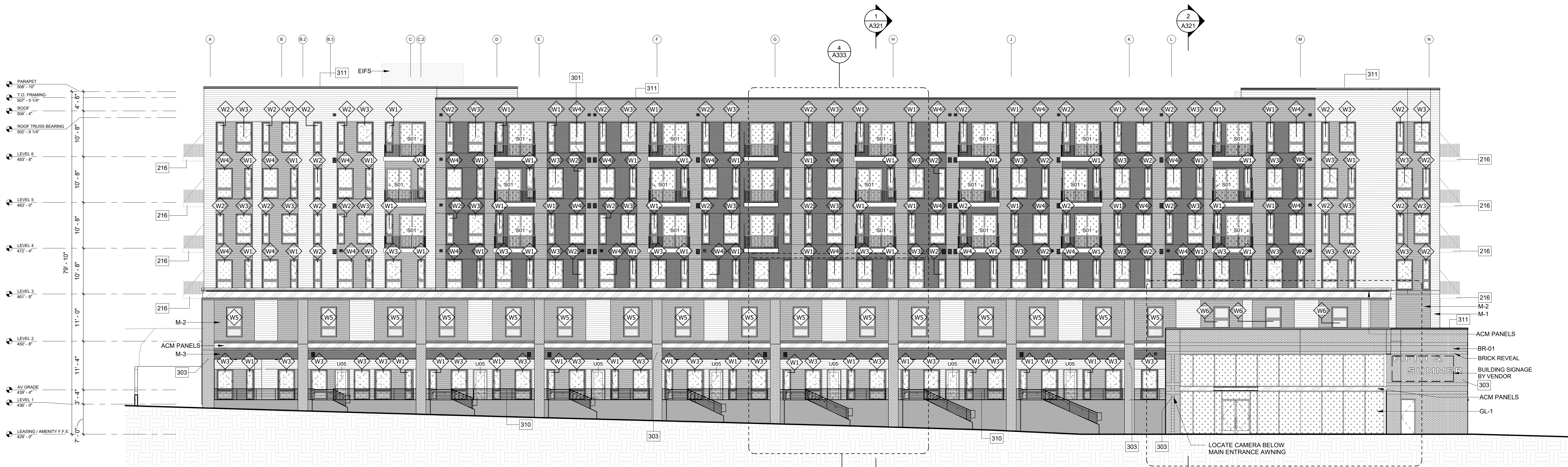
1 WEST ELEVATION 3/32" = 1'-0"