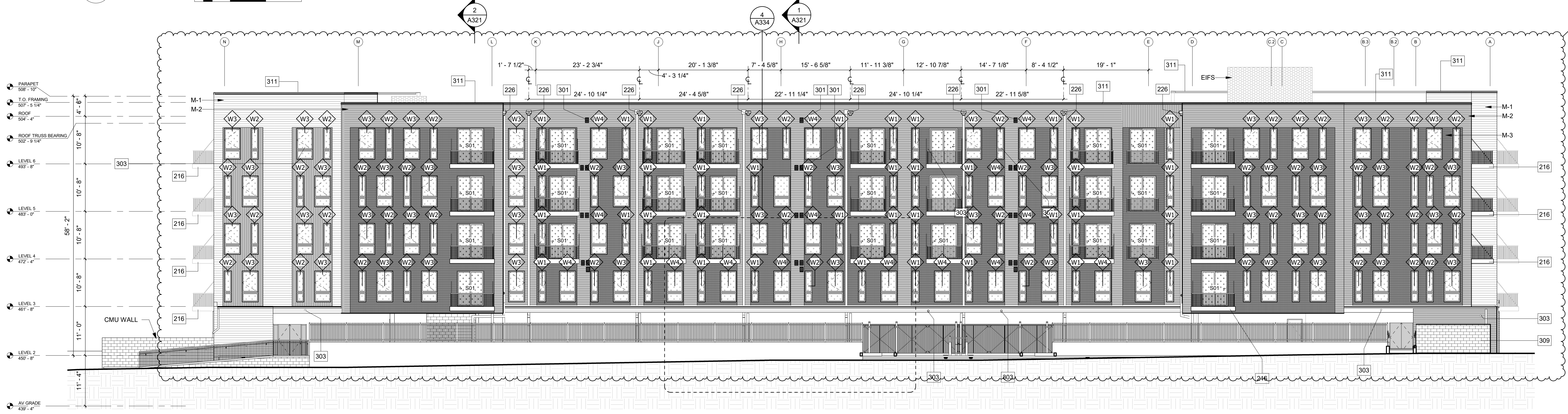
2 EAST ELEVATION 3/32" = 1'-0"